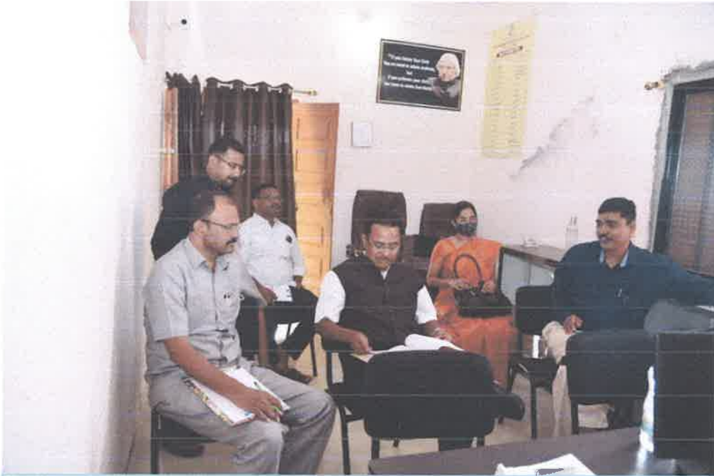
Committee visit to IQAC