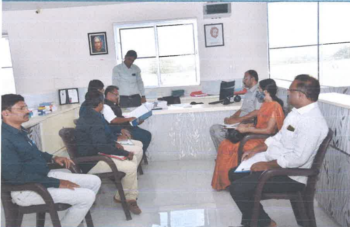
Committee visit to Library @ Inspecting Records