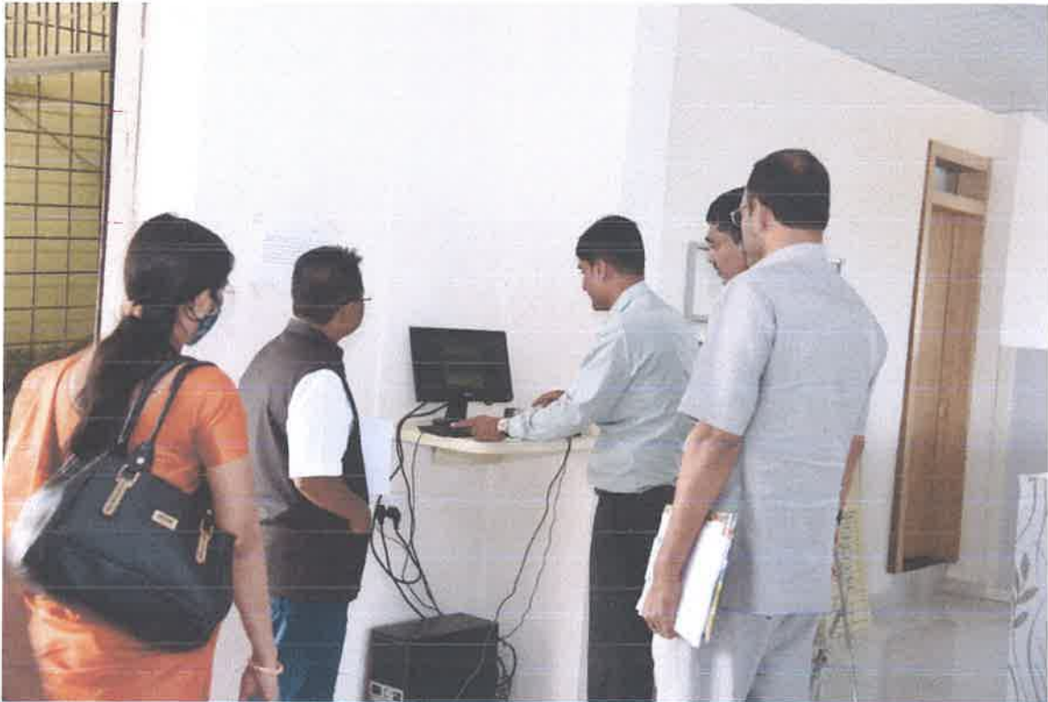
Committee visit to Library @ OPAC